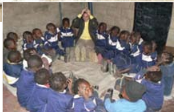
Singing "heads and shoulders, knees and toes" outside our classroom in Chibolya.